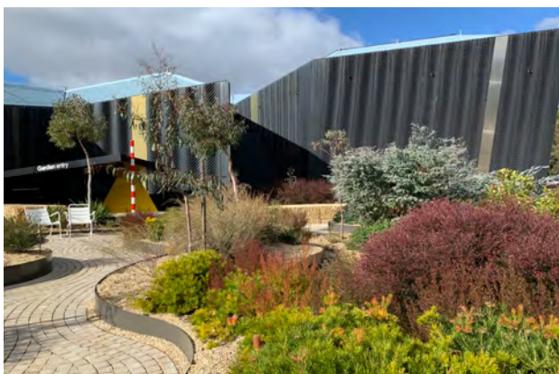
Christina and Trevor Kennedy Garden

The Museum has beautiful outdoor spaces: